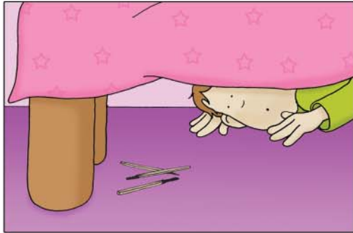
Burnt matches lying around